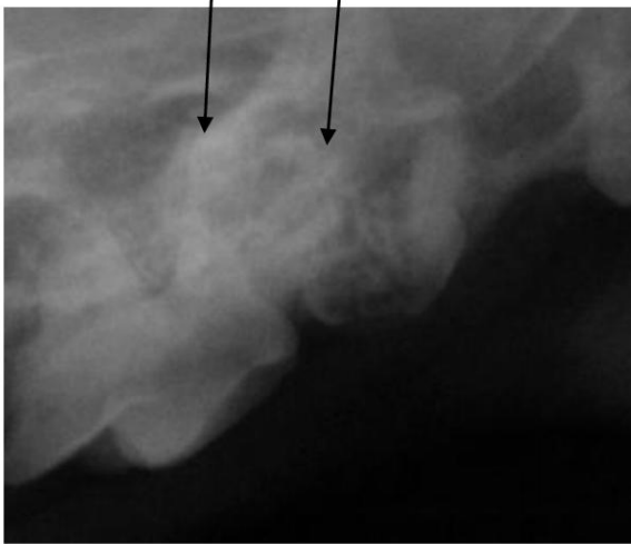
Roots of teeth that are being resorbed by the body

This is a lesion where the tooth breaks down from the cementum layer of the tooth. This is the layer of the tooth that holds the root to the bone. It will then progress and spread throughout the tooth, either dissolving the root or causing a weakness in the crown of the tooth (the part of the tooth you can see). These are found commonly in cats, and we are now starting to see more of these lesions in dogs. Unfortunately, the only way to cure these lesions is removal of the tooth